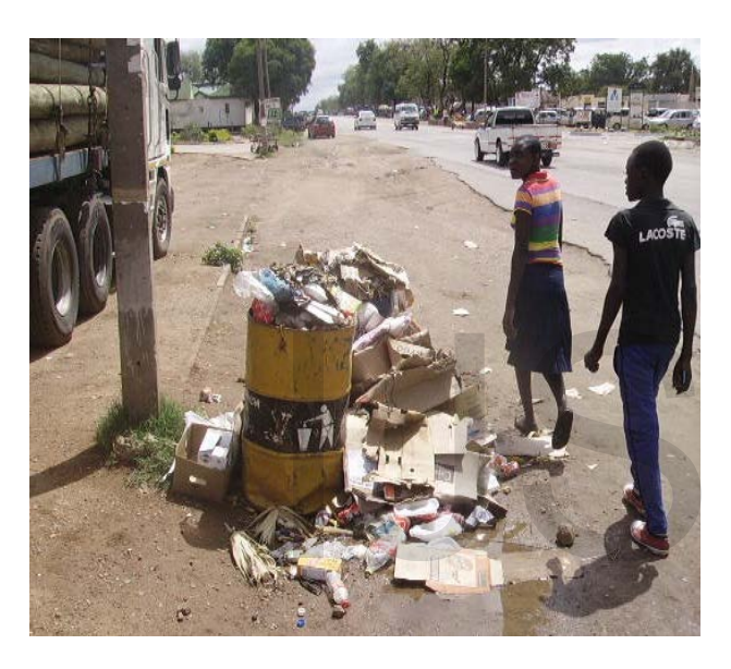
Plate 2: An overflowing bin that has been like this throughout Easter holidays, opposite Caltex filling station in Gwanda. This is along the Bulawayo-Beitbridge main road, Gwanda 2015

In the case of Gwanda, two thirds of waste from residential and commercial areas remains uncollected (Haight, 1994). Failure to collect solid waste results in residents disposing of the garbage on the streets or on unofficial dumps. The picture below shows solid waste that was not collected in time during the 2015 Easter Holidays. Lack of proper management of solid waste was also observed in Gwanda town. A bin is full and the authorities took long to attend to it. The photo was taken around 09:00 hours (6 April 2015), the time we expected the town council department of solid waste management to have emptied most bins in the town.