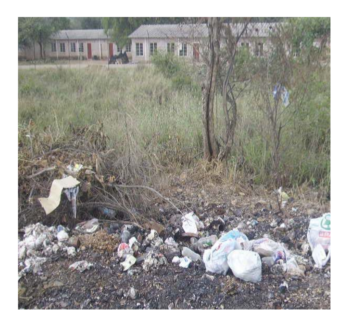
Plate 1: Illegal Dumpsite in Spitzkop residential area (Gwanda, April 2015)